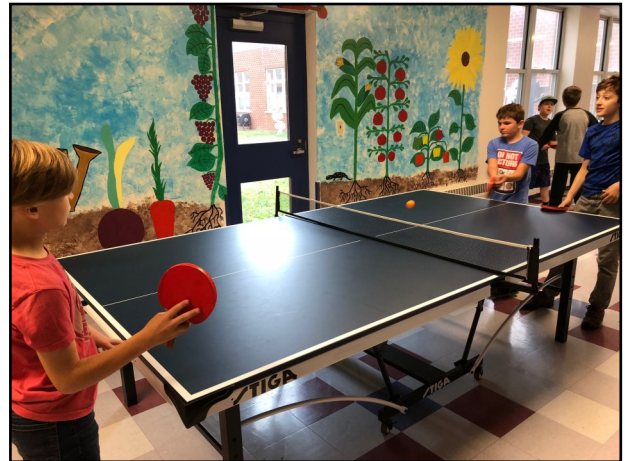
TABLE TENNIS/PING PONG (Grades 5-8)

Join your friends after school for a challenging round of table tennis. Skills, drills, team spirit, and leadership opportunities await any player at any level who has a love for the game! Get in on the fastest growing racquet sport in the world. Table tennis is a healthy form of exercise that is good for the brain. Come join other players as we build the Cape table tennis legacy.